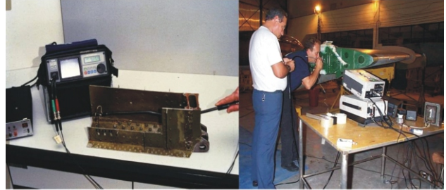
Figure 4: Development in laboratory (a) and in the field (b) of the eddy current inspection guided by a video probe (Garcia et al., 2001).

The main achievement of this project was to give the Brazilian Air Force the necessary time to transition from this aircraft to its replacement and increase the structural reliability of the AT-26.