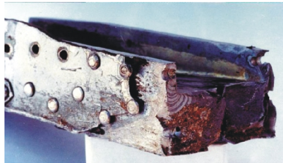
Figure 2: AT-26 wing main spar failure (Mello Jr., 1999).

The first in-house DTA work was with the BAF AT-26 "Xavante". This aircraft was originally designed under a safe-life structural concept. It is a light ground-attack, reconnaissance and training subsonic jet aircraft. It was produced by EMBRAER under license from the Italian manufacturer Aermacchi SpA. The first plane flew in 1971. More recently, in the mid-90s, 4 accidents were reported two with BAF airplanes and 2 others worldwide involving this type of aircraft. All of them were related to structural failure in the wing spar (Fig. 2). Subsequent analysis showed that the failure was due to manufacturing quality problems caused by improperly drilled holes in a critical area (Mello Jr, 1999).