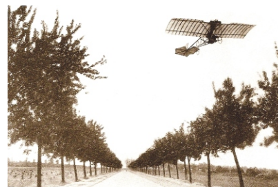
Figure 1: Demoiselle Santos Dumont's first ultra-light plane 1908 (Winter, 1998)

The safe life approach is based on the life-to-failure test divided by a scatter factor, usually three or four, to account for uncertainties in material properties, manufacturing and assembly processes, and applied loads. When strictly enforced, the safe life approach imposed a severe penalty: if the service life was reached, then the fatigue life was deemed expended and the aircraft removed from service. However, if a flaw existed in the structure, the safe life did not ensure flight safety.